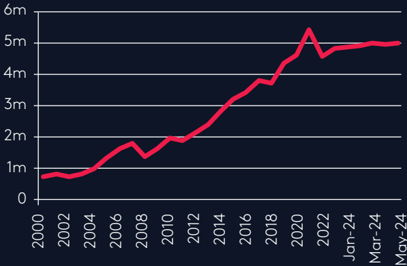
Evolution of fund net assets (EUR million)*

We structure management fees in a manner that is cost-effective and VAT-efficient.